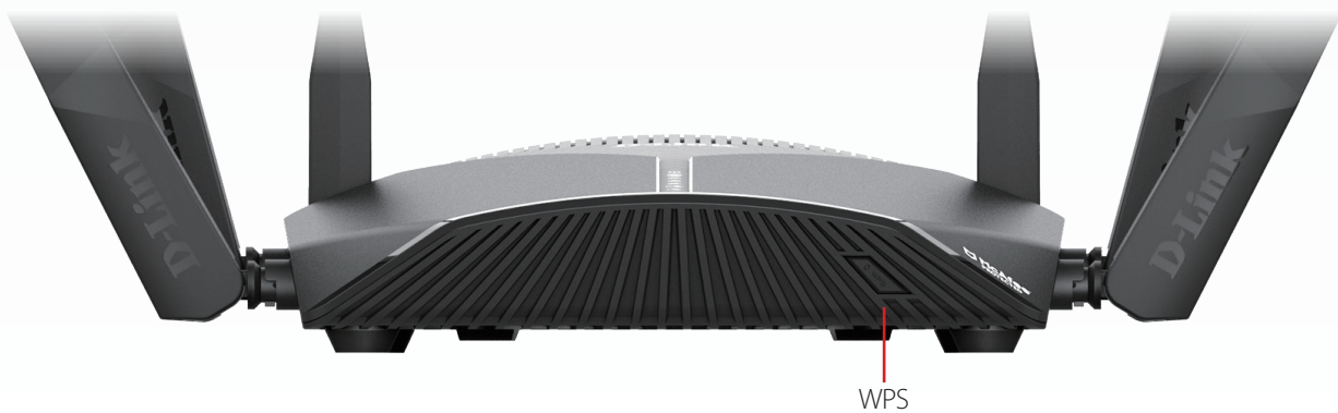
DIR-3060 Router Back View